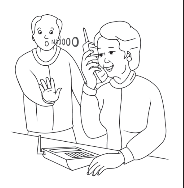
"Sure, I accept your offer to sell in exchange for 20 lottery tickets."